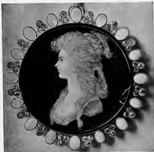
PORTRAIT OF A LADY (NAME UNKNOWN) BY PIERRE PASQUIER (1786)